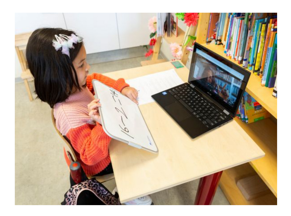
Figure 1: Photo from Studenten voor Educatie sessions.