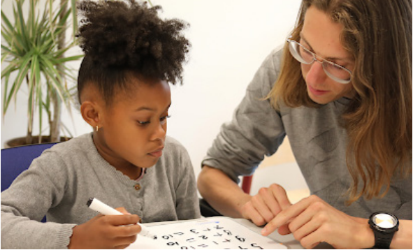
Figure 3 – 4: Photos from the Studenten voor Educatie tutoring sessions.